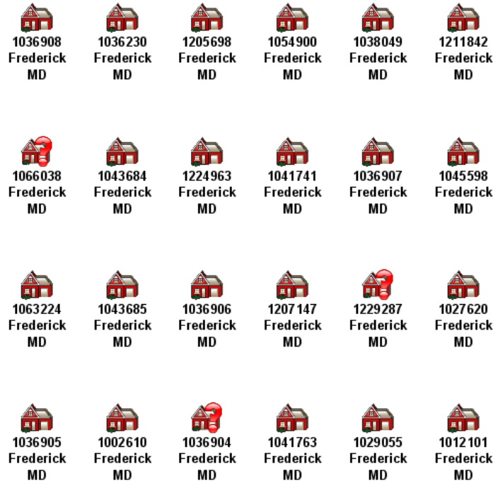
Figure 3. Depiction of Proactive Query Results

name, and middle name or 2) first name, last name, and date of birth or 3) first name, last name, and ZIP Code. Each different combination of values will affect how the system behaves and produce different results depending on the collection and content of the underlying data.